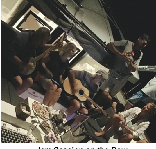
Jam Session on the Bow

Perfect View is 45 ft long with a beam of 26 ft. While it may appear that we "downsized" from the 50 ft monohull (with a