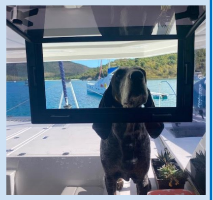
"What's cooking in the galley?"

The word "whelm" actually means to be engulfed or submerged, as if under a wave.