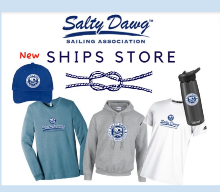
We have a New Ship Store !!! Click HERE