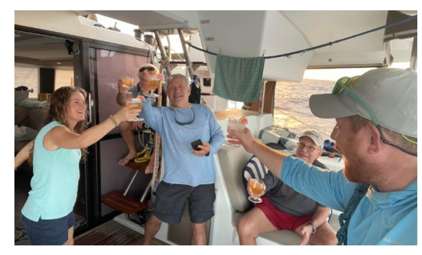
Crossing the Tropic of Cancer

We worked on getting crew first. Even though we were early, we promptly put a Rally crew wanted listing on the SDSA site. We were inundated with responses from friendly, well qualified SDSA members. We conducted 17 one-hour interviews over three weeks and then debated the candidate's qualifications, experience, and compatibility. In the end we had to decide based on our gut instinct. I'd say we chose well, but that may say more about the Dawgs than our selection.