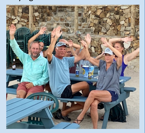
Dawgs in Virgin Gorda