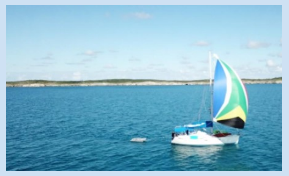
SV Woza Moya