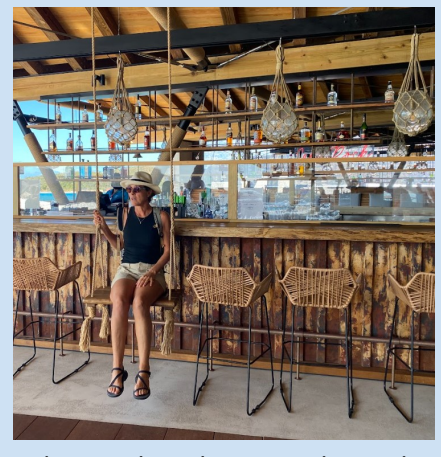
Flying Fish at the new Saba Rock